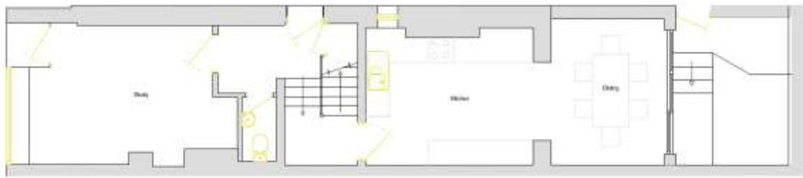
Ground Floor As Existing